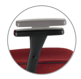
GI armcap moves up and down for effective arm support.